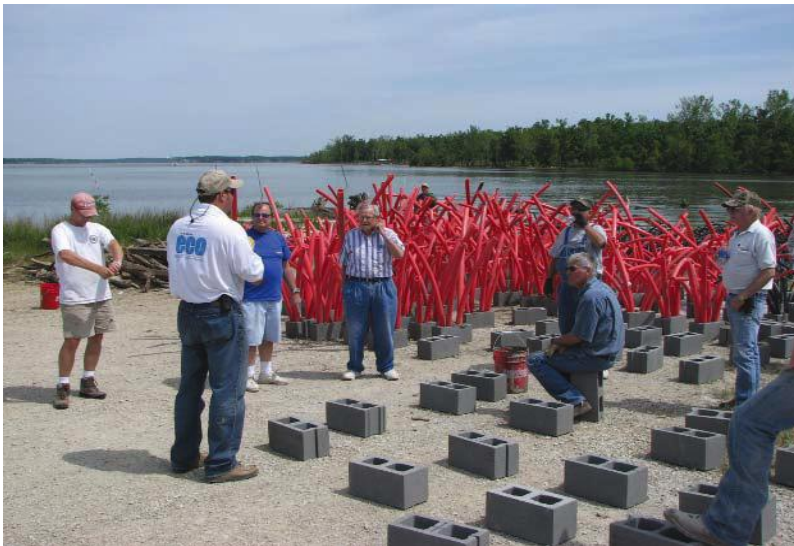
Figure 1. Grand Lake efforts used deficient PVC and foam materials

The floating island spawning platforms are anchored for the winter. The planting efforts were again informative but had mixed results. It didn’t help that some beavers took a liking to the buffet line at Elephant Butte, eating most of the cattails. I am working with the inventor to develop some alternative strategies to provide an artificial “nursery” under the islands to provide the fry with some protection. Also, we are working on a different bed design for the Tingley Beach Island. Overall, though, the results have been good and the project was published in the Bass Times magazine, giving deserved credit to the Kids of the Southwest.